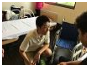
Practice of nursing skills