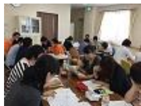
Preparation of nursing care plan