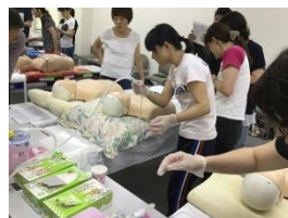
Medical care exercises

Education and training benefit system lecture